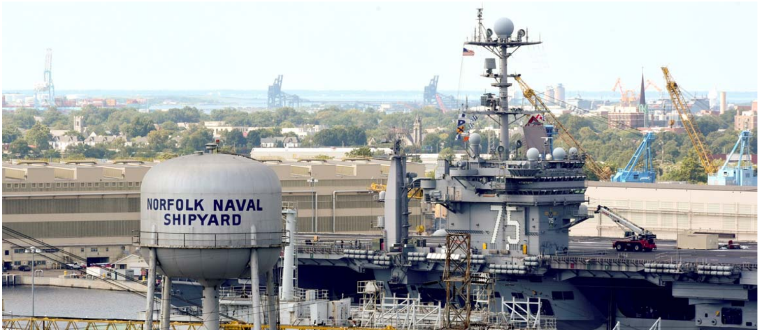
Figure 1. Present-Day View of the Norfolk Naval Shipyard